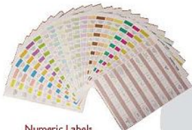
Numeric Labels 40 Labels Per Sheet

Suitable for most laser & inkjet printers Available in 25 Assorted Colours