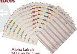
Alpha Labels 24 Labels Per Sheet